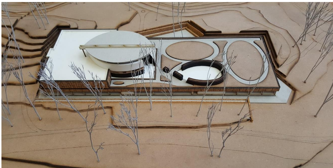
A model by MArch student Rudi Vermeer of a seed cultivation centre in Pretoria, 2017.